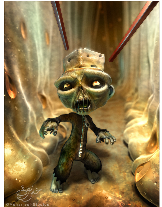
Tofu the Vegan Zombie

You've probably just hated how it was prepared.